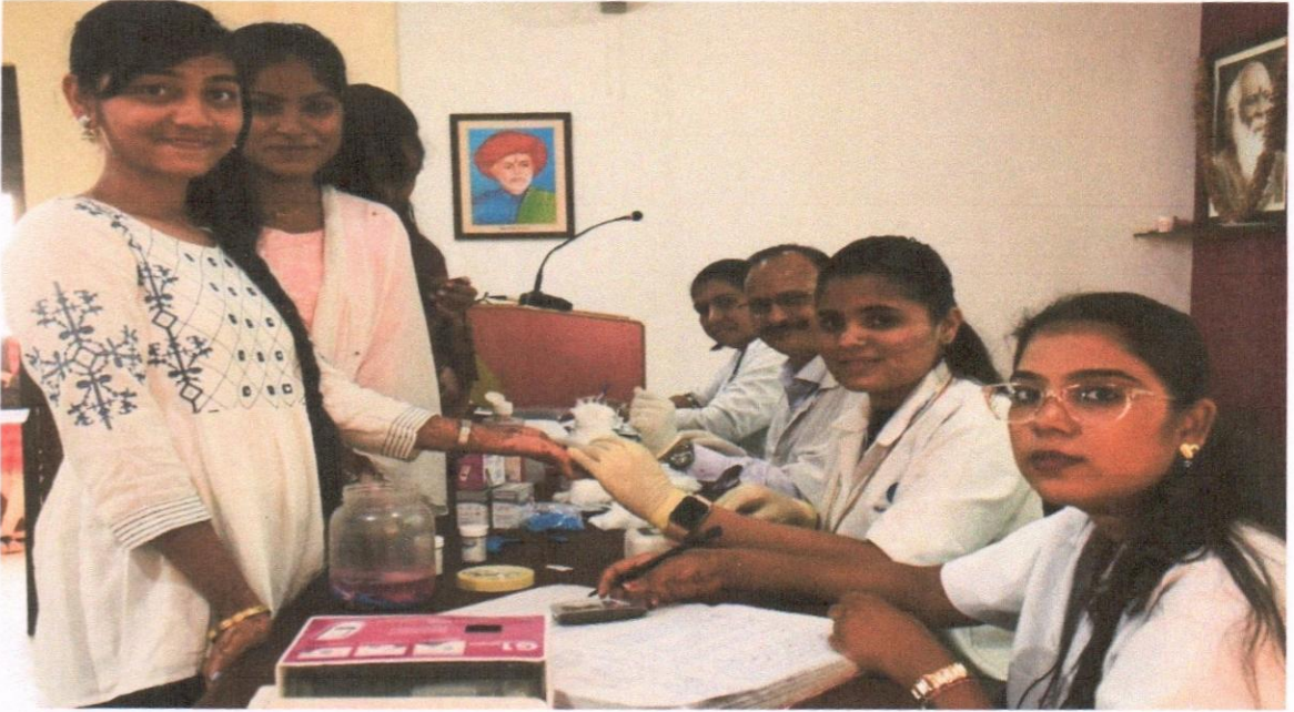
हिमोग्लीबीन तपासणी करताना विद्यार्थिनी व YCM हॉस्पिटल स्टाफ